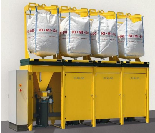
Fig.: PFD 4 WS