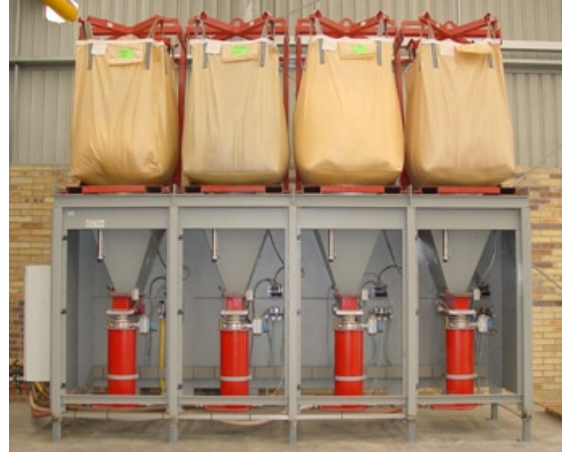
Fig.: PFD 4 WS