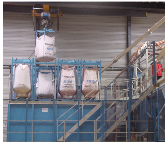
Fig.: 2 x PFD 4 WS für 2 Mischer