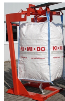
Big-Bag-steel rack with lifting hooks

KI MI DO KINDLER GMBH Misch- und Dosiertechnik